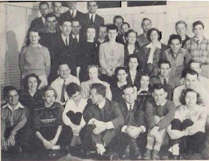
We had a meeting Saturday night.