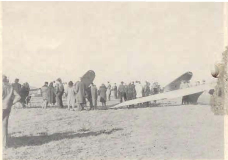
It looks almost like Elmira.